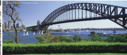
Sydney is home to UNSW and Singapore is home to UNSW Asia. Students can transfer from one campus to the other seamlessly.